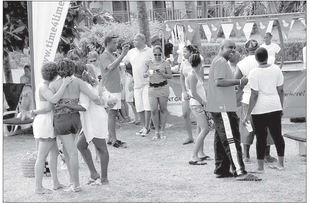
Music lovers liming at Bequia Beach Hotel