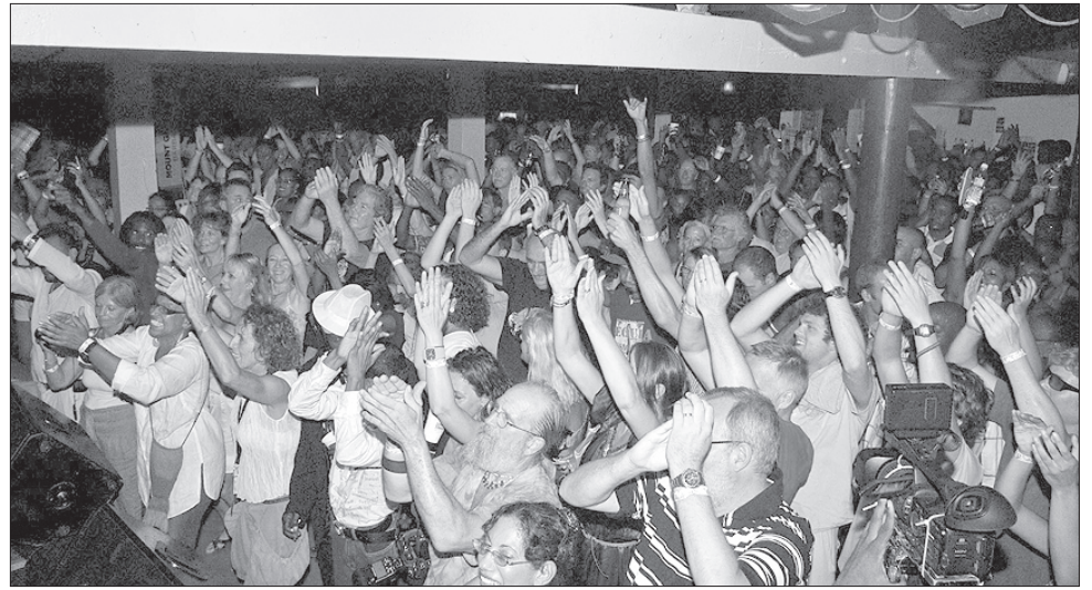
Crowd at De Reef